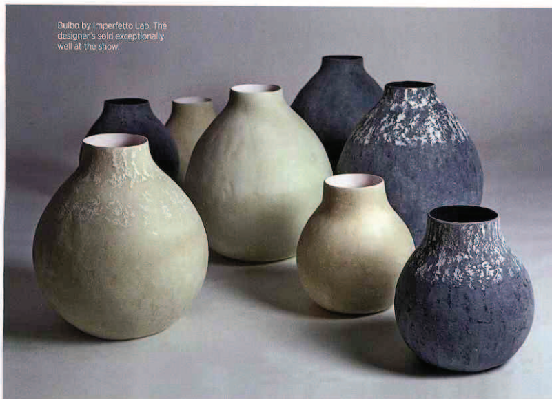
Bulbo by Imperfetto Lab. The designer's sold exceptionally well at the show.